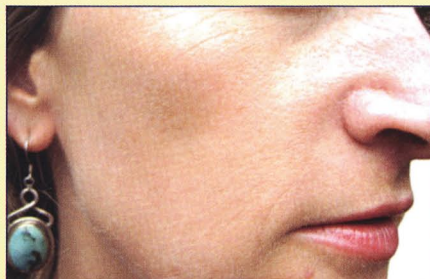
After BBL Tx