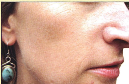
After BBL Tx