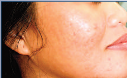
After ProFractional XC Tx