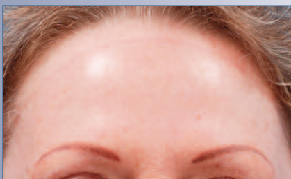
Five weeks after ProFractional XC Tx