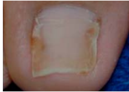
2 months post 2 treatments