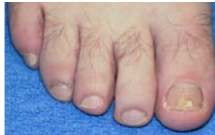
2 months post 2 treatments