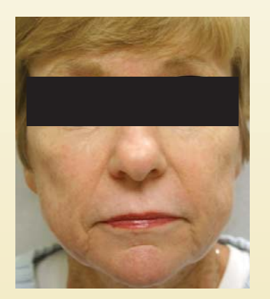
After ProFractional Tx

"I've been doing a lot of ProFractional for lines and wrinkles, and the patients have been thrilled, especially those who've had other procedures and can compare those results with what they see here."