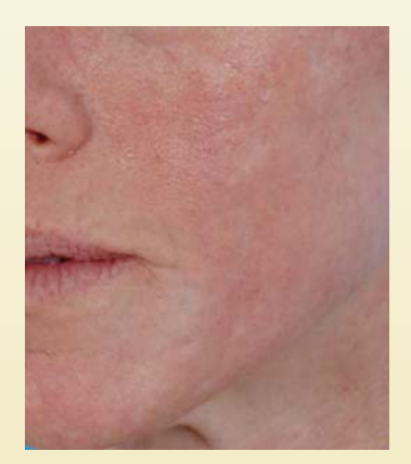
After two MLP and ProFractional treatments