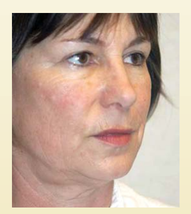
Five weeks after MLP and ProFractional Tx