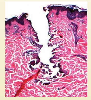
ProFractional Variable Treatment Depth - 1,000 microns