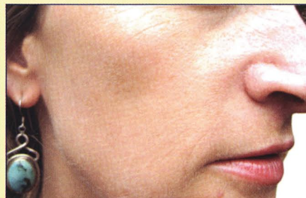
After BBL Tx