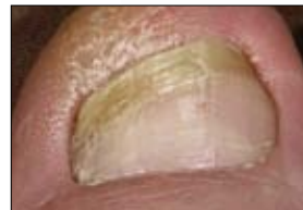
7 Months After 3 Treatments