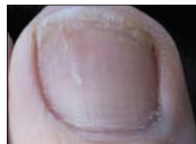
8 Months After 1 Treatment