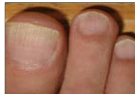
12 Months After 1 Treatment