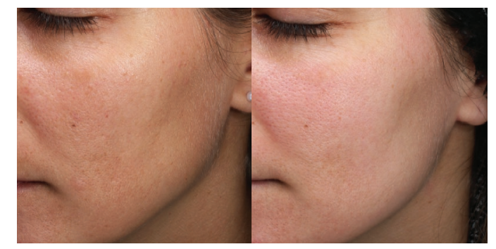
MOXI™ | Post 3 Tx | Courtesy of Aestheticare