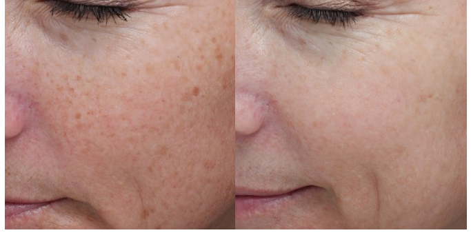
MOXI™ + BBL® HERO | 1 Month Post 1 Tx