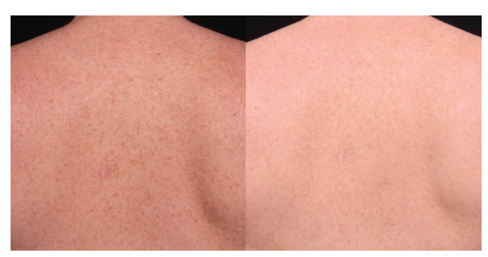
BBL® HERO | 1 Month 3 Tx | Courtesy of Steven Swengel, MD