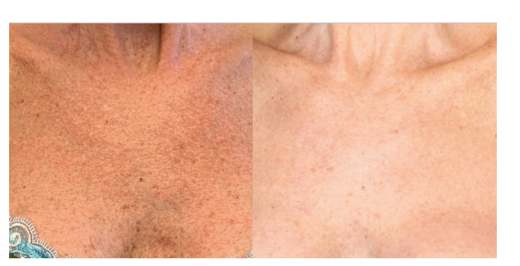
BBL® HERO | 1 Tx