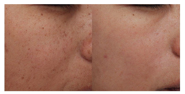
BBL® HERO | 2 Months Post 3 Tx