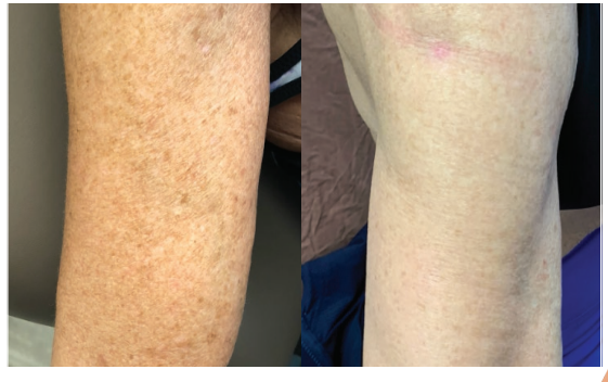
BBL® HERO | 2 Tx