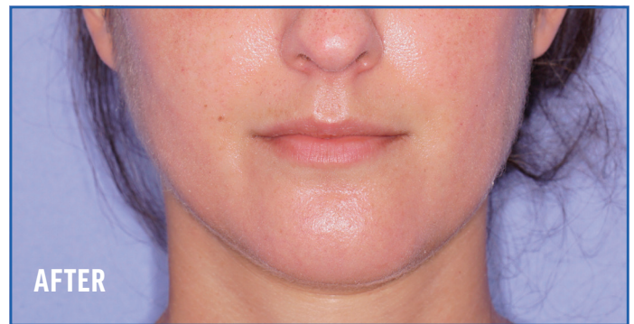
Patients are shown before (left) and after one treatment.

“When treating patients with BBL HERO plus MOXI, we start with 400 to 600 pulses of BBL HERO to cover the face, followed by an immediate transition to MOXI,” Dr. Ibrahim says. MOXI safely addresses deeper pigments than BBL, including for melasma, he explains.